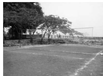
Outdoor Sports facilities