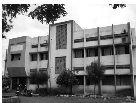
Computer Centre facilities